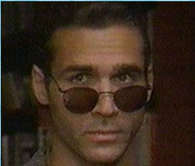
DUNCAN MACLEOD - Played by Adrian Paul

I am Duncan MacLeod born 400 years ago in the Highlands of Scotland. I am immortal, and I am not alone.